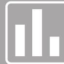
Determining key parameters