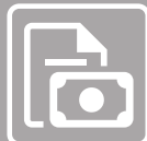
Accounting train path usage