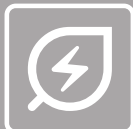
Ecologically optimized driving