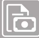
Accounting train path usage