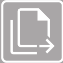
Creating operational documents