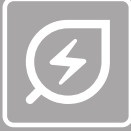
Ecologically optimized driving