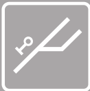
Editing the digital twin