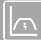
Optimizing driving modes