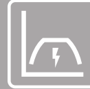
Optimizing driving modes