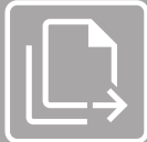
Creating operational documents