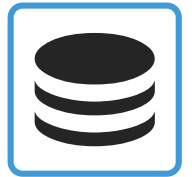
Database and Interface