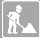
Managing construction sites