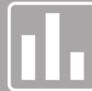
Determining key parameters