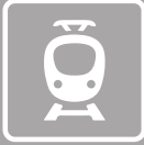
Managing rolling stock