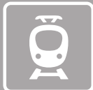
Managing rolling stock