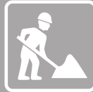
Managing construction sites