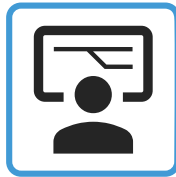
Operations Control Center