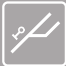
Editing the digital twin